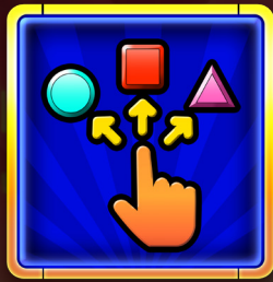
Never the Same Twice